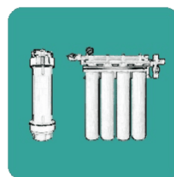
POE | POU

From the day we were established, we always regard product and social responsibility as our mission and responsibility, because what we provide is safe drinking water. We are well aware of the importance of E (environment), S (society) and G (corporate