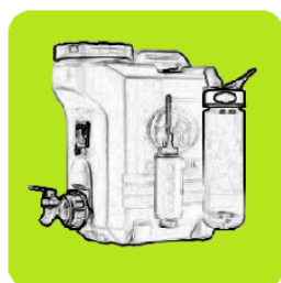
Portable | Personal