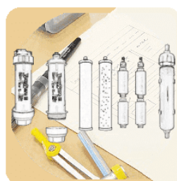
DIY Water Filter